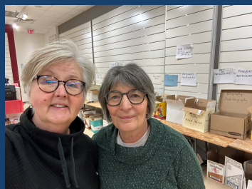
At the Booking Site

January 21 – Finance and Treasurer Workshop by National