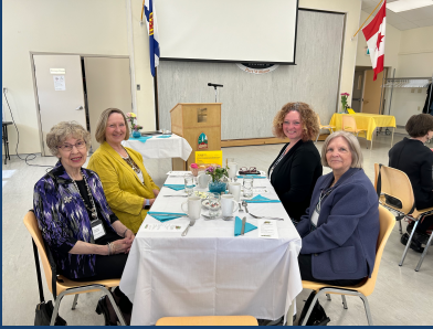
Spring Luncheon 2024