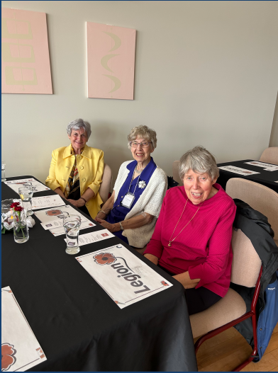
Spring Luncheon 2025