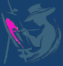
Valley Art logo