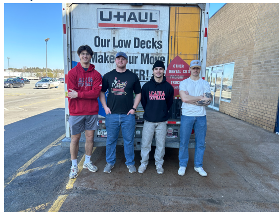
Football players after loading the truck.

After the holiday, more members and community volunteers pitched in to get those book donations sorted into genres. We were fortunate to have a space with a back door leading to the front parking lot of the mall, so it was easier to move the books out. We stopped donations at the end of February.