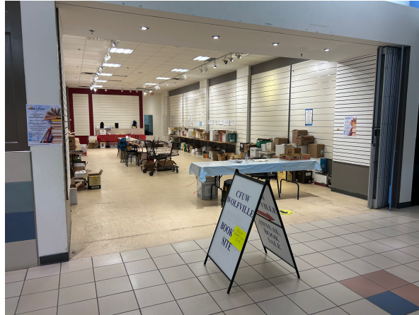
Booking space at the mall.

We begin thinking about the Book Sale a year in advance. We approached Crombie at the County Fair Mall in the summer about obtaining a space in which to process and store our donations. They generously granted us space on November 22, and a small number of members and volunteers worked on donated books until Christmas.