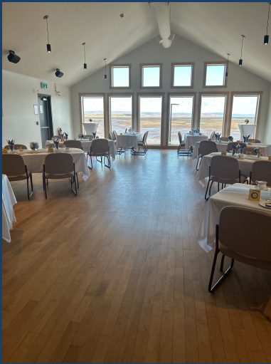
The view is spectacular